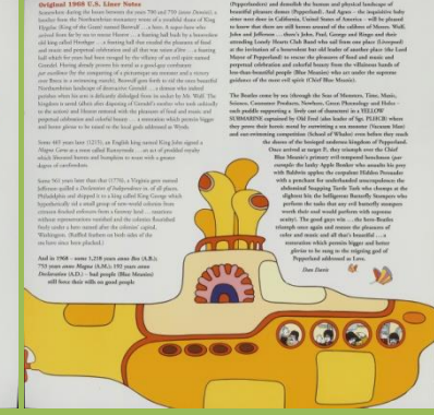
Printed inner sleeve