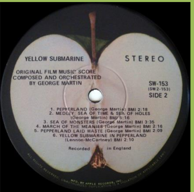
Unknown contract pressing, small pressing ring, All Rights in green print in bottom perimeter on both sides