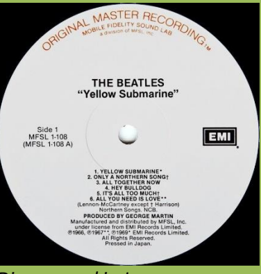
Disc pressed in Japan