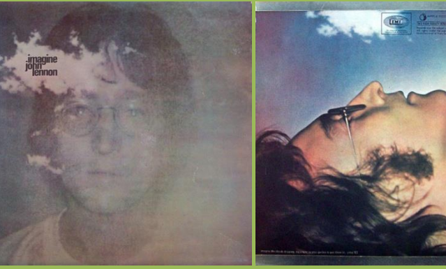
Cover types: 1) Laminated flipback cover