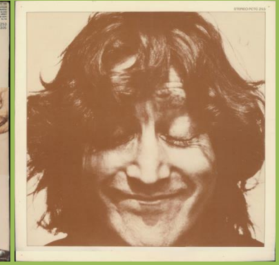
Australian inner sleeve