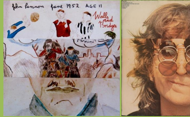
Australian gimmick gatefold cover