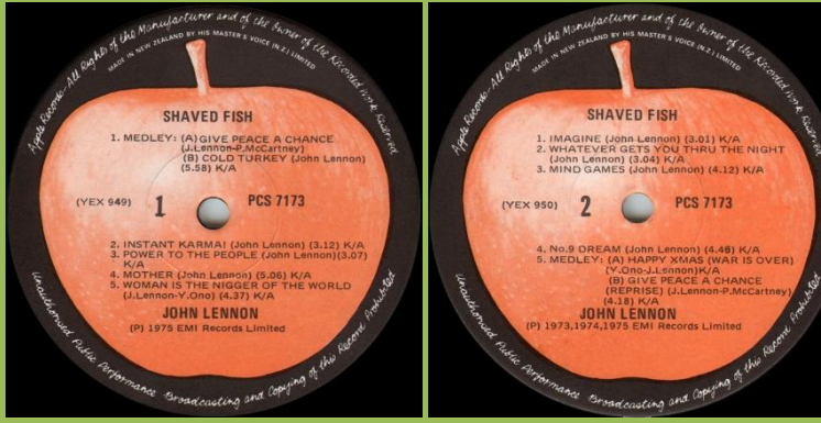
Cover type 2