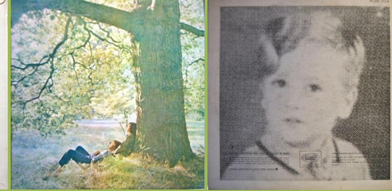
Laminated cover without flipbacks