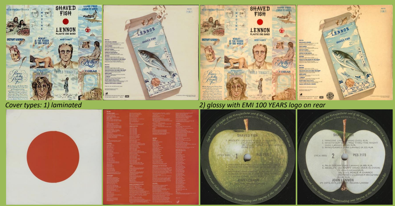
Cover type 1