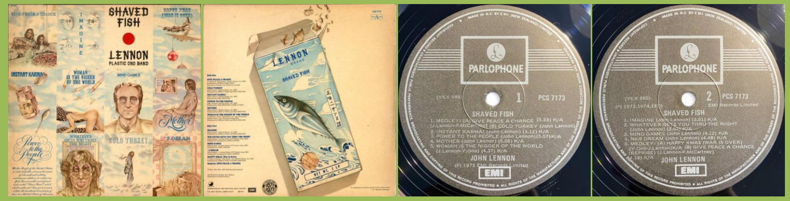
Apple logo on rear cover