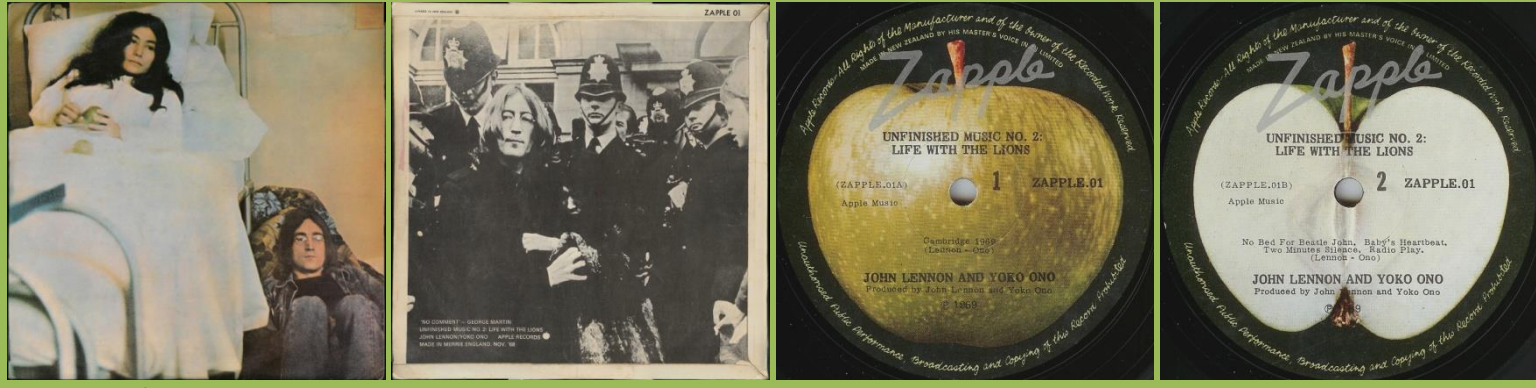
Laminated flipback cover