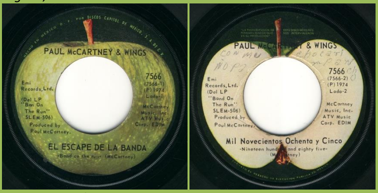
Without print 'Marcas Produced & Paul aligned Registradas', Del LP Ban On The Run

McCortney Music, Inc. ATV Music Corp./EDIM