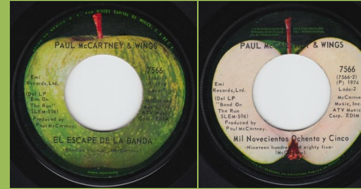
With print 'Marcas Registradas' Produced & Paul not aligned on bottom, EMI and Records aligned, Del LP Ban On The Run