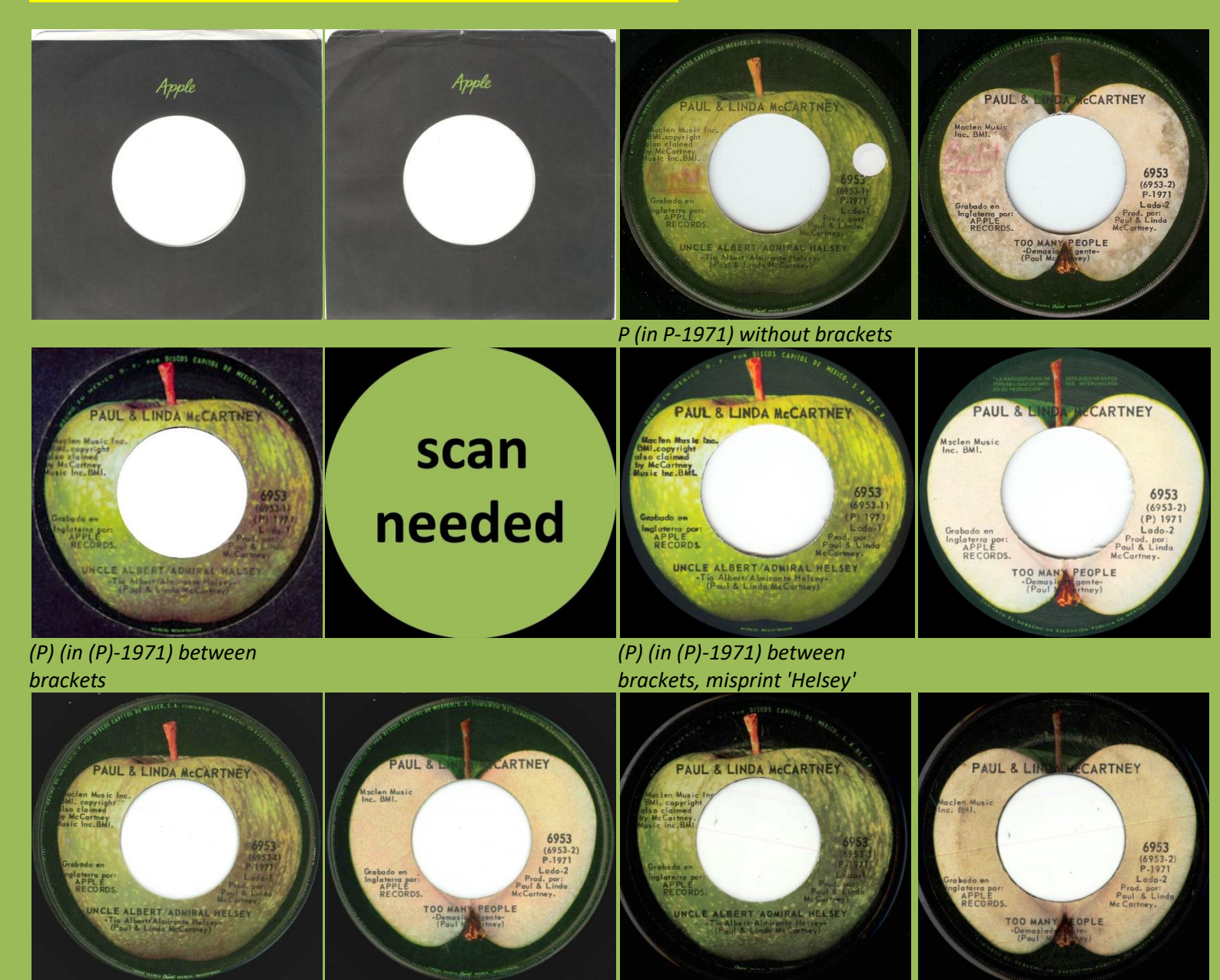
P (in P-1971) without brackets, 'Helsey' misprint, 'Tio...' print starts under c in Uncle

APPLE 6953 - UNCLE ALBERT - ADMIRAL HALSEY / TOO MANY PEOPLE