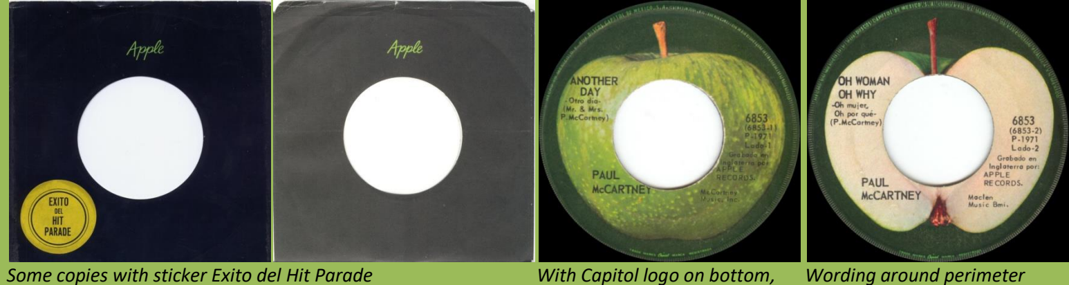
Some copies with sticker Exito del Hit Parade

APPLE 6853 - ANOTHER DAY / OH WOMAN, OH WHY