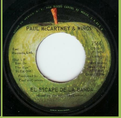
With print 'Marcas Registradas' Produced & Paul not aligned on bottom, EMI and Records aligned, Del LP Ban On The Run