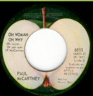
Wording to left and right of Apple stem

APPLE SEC-018 – SMILE AWAY / THE BACK SEAT OF MY CAR