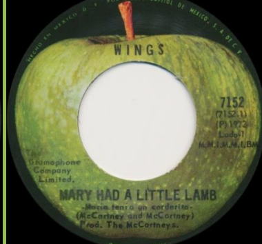
The 7 in 7152 starts over the 1 in (7152-1)