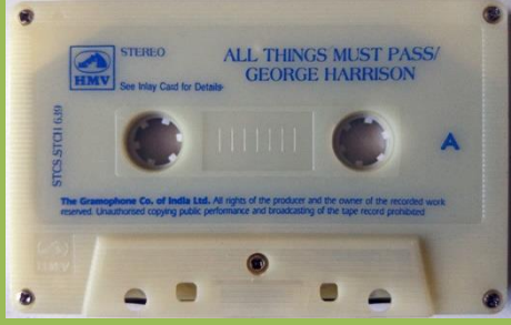
Produced by GEORGE HARRISON and PHIL SPECTOR for Apple Records. on J-card