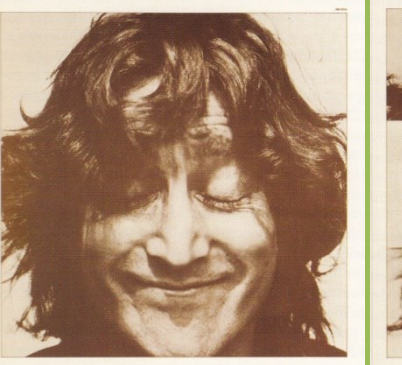
Printed inner sleeve (Made in USA)

Lennon) BMI 4:35 ) BMI 3:25 en You're Down and ewis) BMI 1:06 (P) 1974 EMI Records Limited