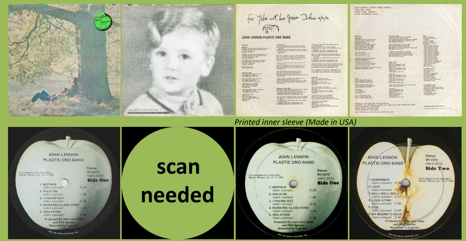
Compo pressing (Small pressing ring)