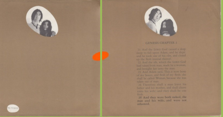
Brown outer bag (most copies sealed with an orange sticker)