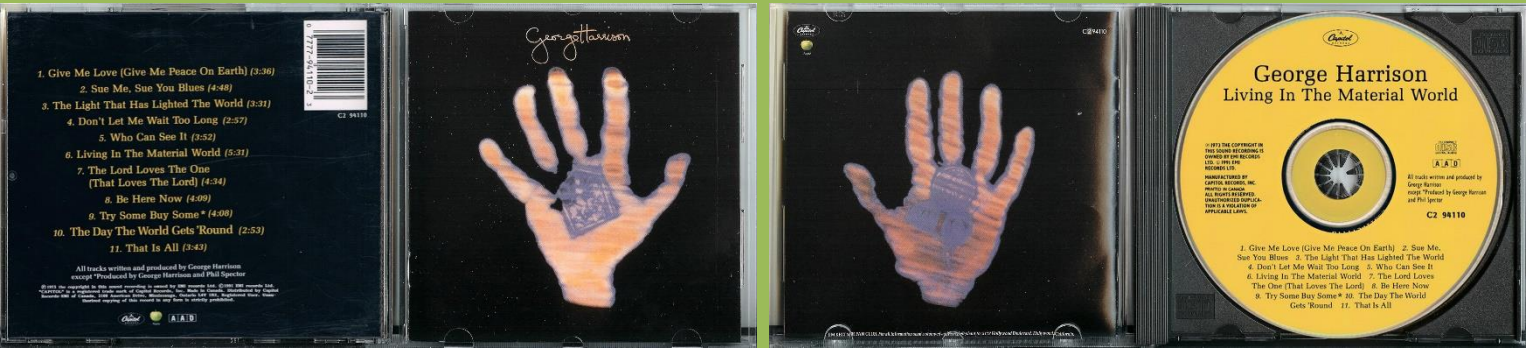
Apple on rear cover