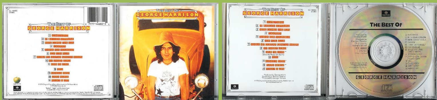
Small Apple on rear cover